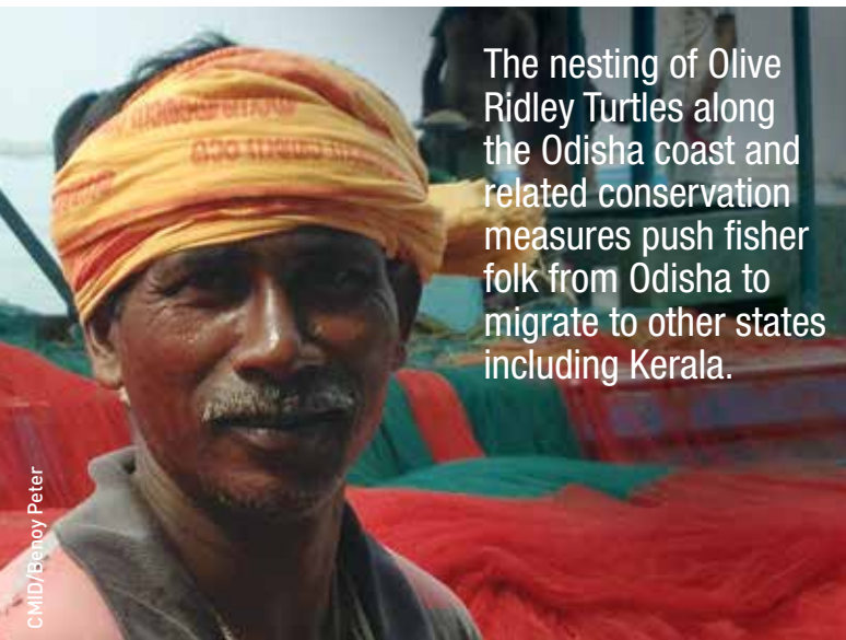
The nesting of Olive Ridley Turtles along the Odisha coast and related conservation measures push fisher folk from Odisha to migrate to other states including Kerala.

fishers from Kanyakumari operate their mechanised boats from the Kerala coast. Known for their exceptional fishing skills as well as their willingness to undertake deep sea fishing expeditions, fishers from Kanyakumari captain most of the trawlers that operate from Kerala. Colachel in Kanyakumari and Rameswaram in Ramanathapuram are two major pockets in Tamil Nadu from where fishers come to Kerala. Fisher folk from Mangalore region operate from the harbours in the northern Kerala, such as Azhikkal in Kannur. Fishers from Andhra Pradesh were also found engaged in boats that operate from Azhikkal. Vizianagaram and Srikakulam were the districts of origin as reported by these fishers. Migrant fishers from all states were men and most of them were hired through their social network.